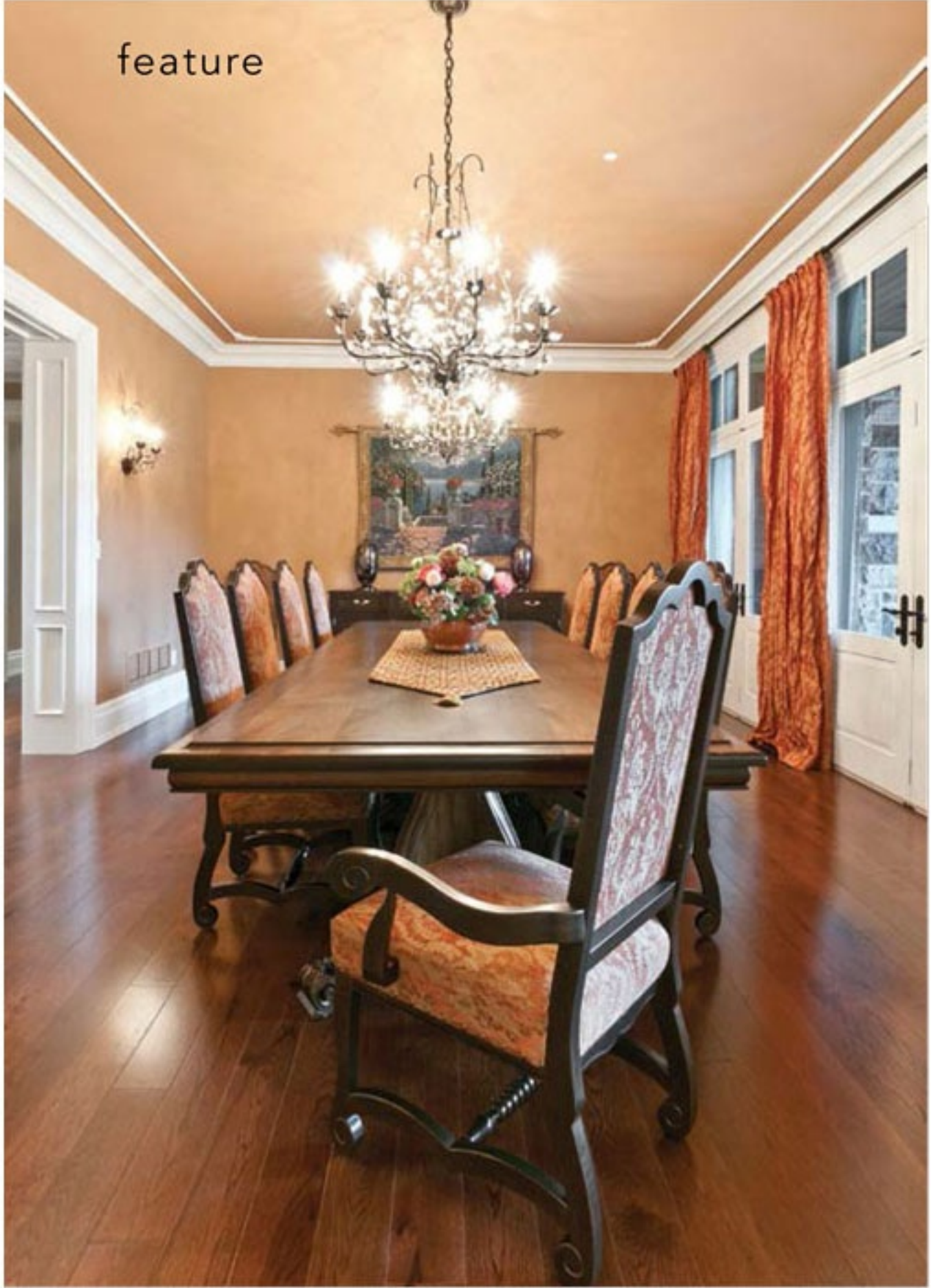
LEFT: The dining room is a Tuscan escape with the warm tones of walnut and sienna. BELOW: A games room is a great place to retire for an evening of entertainment. BOTTOM: The office is enclosed with glass french doors to keep work neatly tucked away.